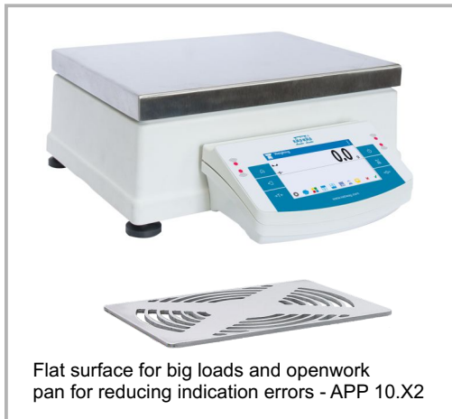
Flat surface for big loads and openwork pan for reducing indication errors - APP 10.X2