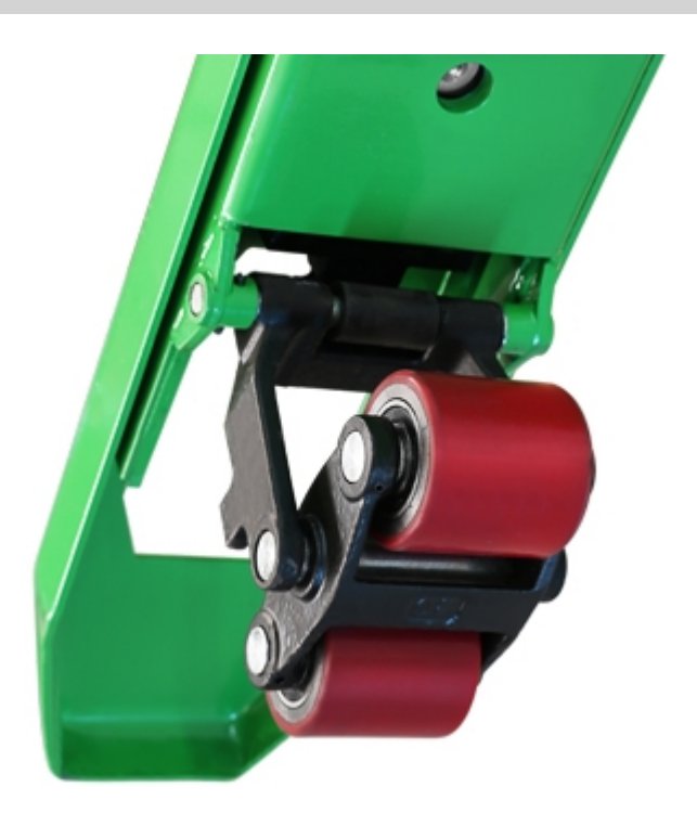
Closed Forks underside, for a higer protection against dirt.