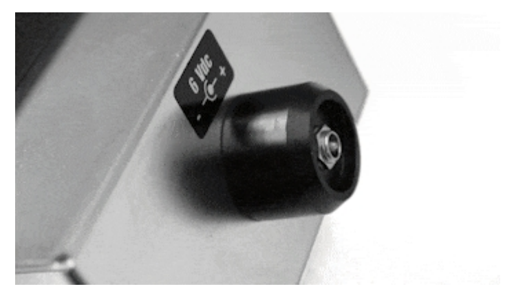
Battery with INSTAPLUG innovative quick coupling wireless system.