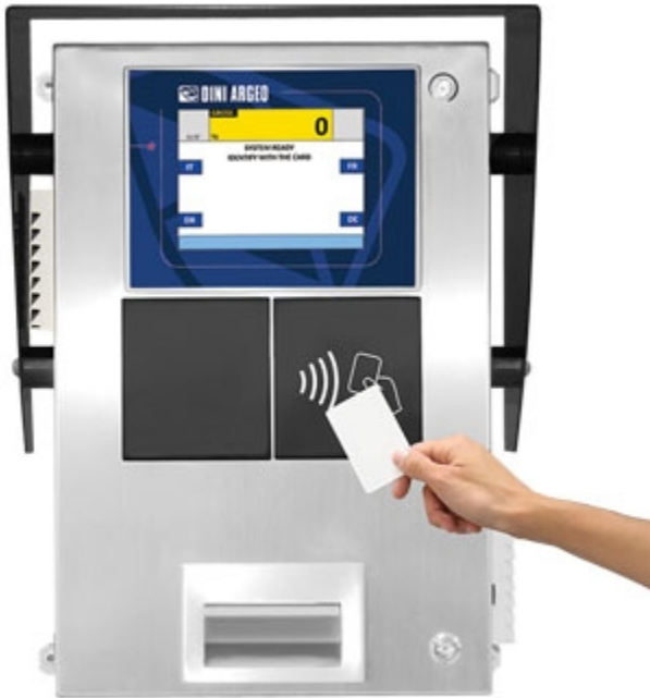
3590EGTBOX8: with RFID card reader.